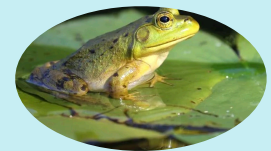
Mississippi Valley Field Naturalists Bursary