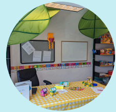
Summer Literacy Programs

To achieve even more success the Directors decided to expand the support geography and invite libraries and other literacy and learning groups, across all of Lanark County, to submit request letters. The articles that follow in this inaugural Newsletter, point to some of these new successes.